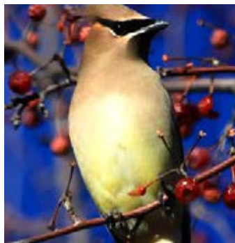
During late winter, you might spy a visiting waxwing feasting on berries.

The shrubby underbrush here is ideal habitat for small birds, like the nuthatch, wren, sparrow, chickadee, finch, robin, and migrating seasonal visitors. In early 2017, Moscow Cub Scout troop 323 built and mounted 22 beautiful birdhouses to help improve nesting habitat for these little birds.