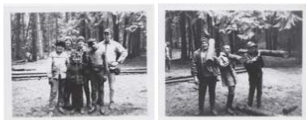
Above: Troop 343 and Troop 344, 3/18/1967.

S ince the formation of Idler's Rest, Boy Scout Troops have been instrumental in maintaining and improving the trails and habitat at the preserve. The cedar grove was host to many overnight jamborees, service projects and gatherings.